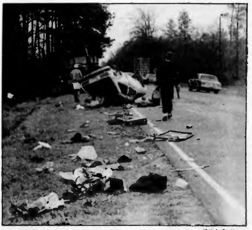
Accident A driver was injured Tuesday in a single-vehicle accident on Highway 401 just east of the Green Pines Trailer Park. An eyewitness said a military convoy stopped, administered first aid and directed traffic until an ambulance arrived on the scene. The accident occurred at approximately 10:30 a.m. No further information was available at presstime.