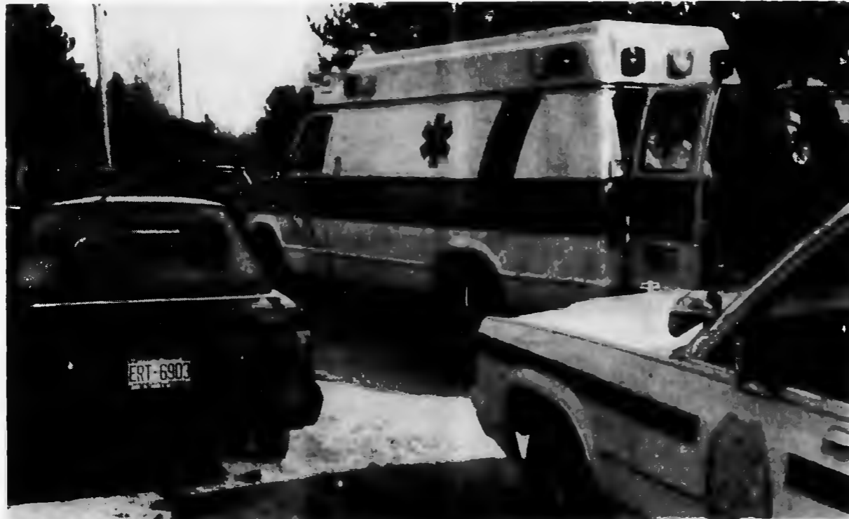
A Raeford woman was shot in the neck while driving this car Monday afternoon.