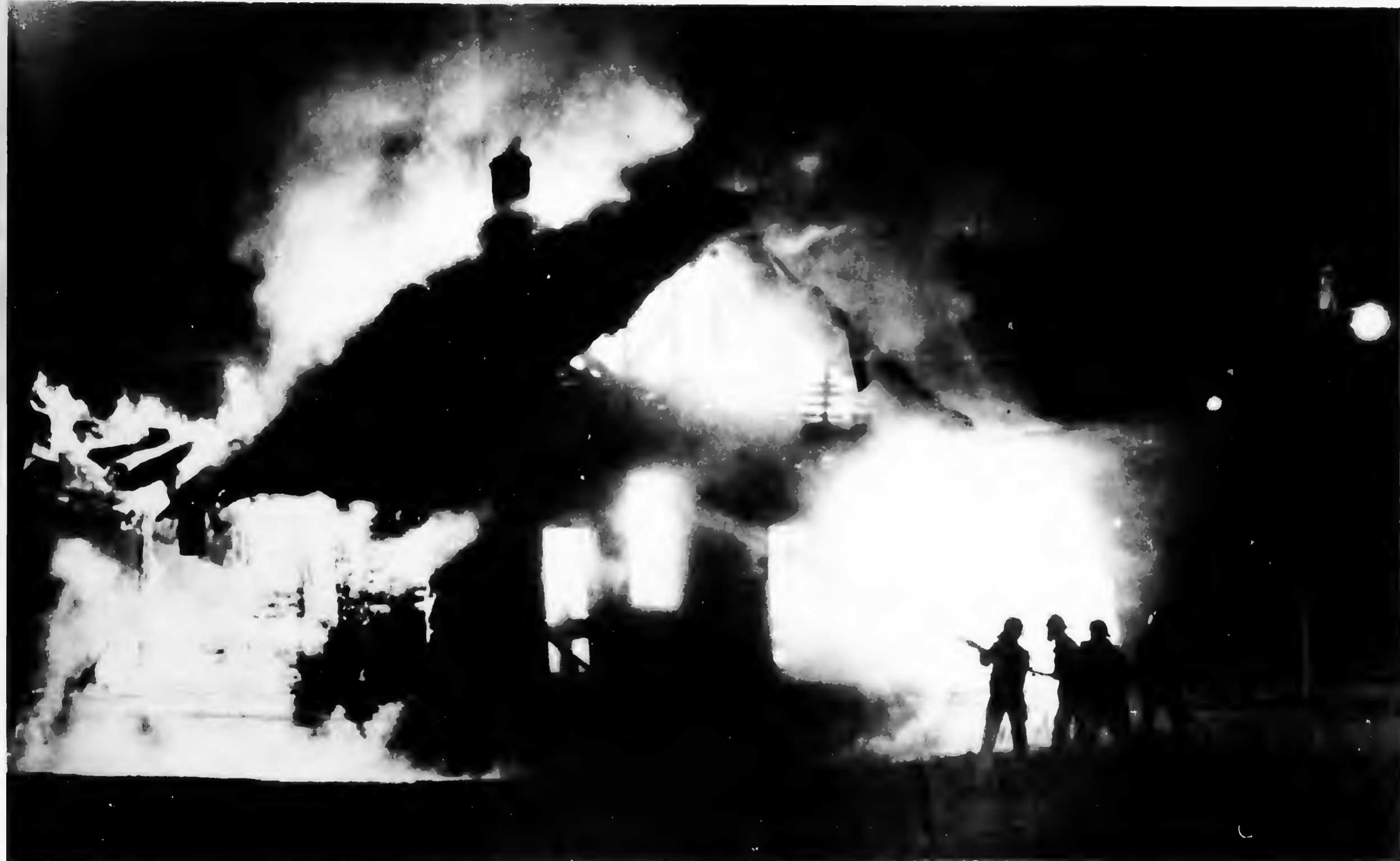
When firemen arrived, the depot was already engulfed in flames and sending sparks and flaming debris over other downtown buildings. The fire was so hot, cross ties of the adjacent railroad track caught fire.

Leach said he never intimidated, intentionally or (See HIRING, page 5)