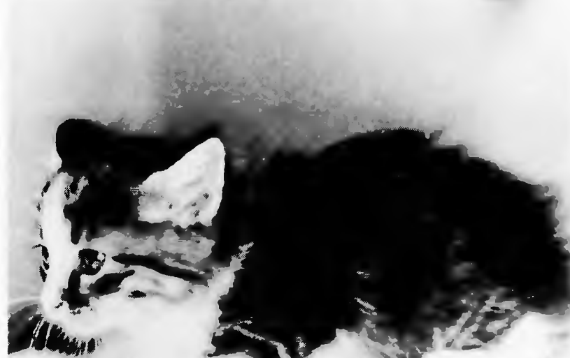
Pet of the week

SCC's Basic Skills Program offers free daytime and evening classes at several locations throughout Hoke County. For more information, contact the Hoke Center at 875-8589.