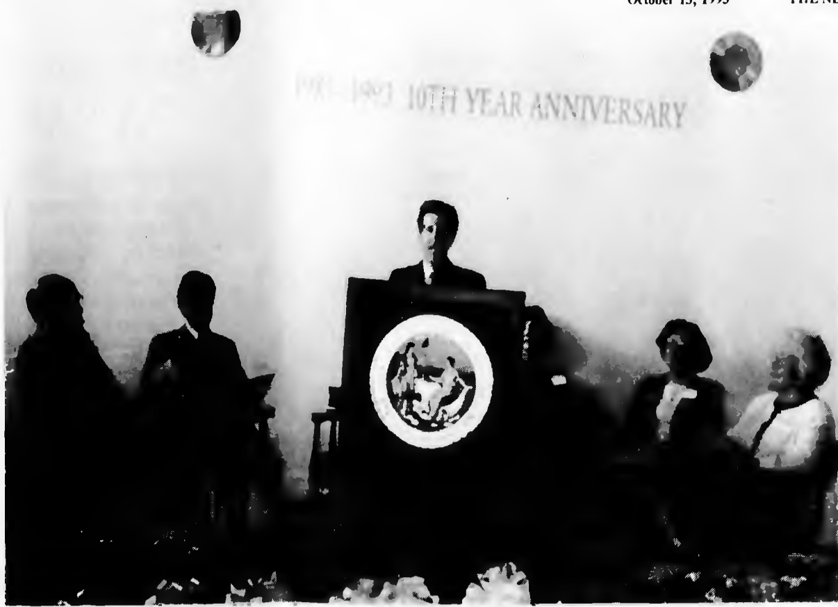
Celebration-State DOC officials and local staff were on hand to help McCain Prison Hospital celebrate its 10th anniversary last Wednesday.

He said those plans tentatively look good, but Hoke must address other solid waste issues in the near future, including a "white" goods (appliances with porcelain) collection by January 1 of next year, land clearing and inert debris as well.