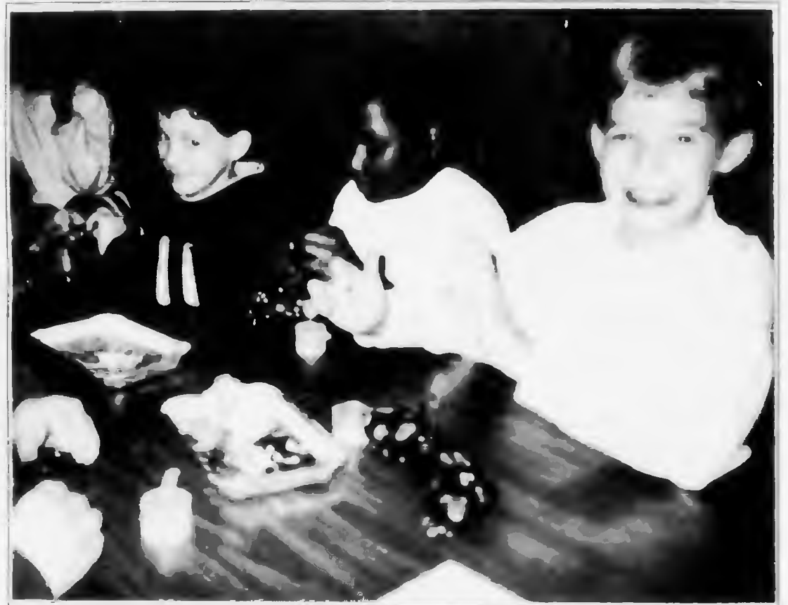
Hoke County 4-Hers are shown here making Christmas Crafts.

All of this is connected - as we move to "save kids' lives" in this country. You are an important link in our Army for Kids—you have helped us by making a personal financial commitment, supporting our work - supporting kids and the Army for Kids. Thank YOU, on behalf of the kids. Thank YOU!