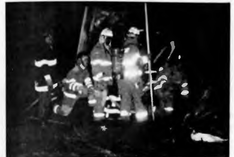
Firefighters at the scene of a trailer fire that is believed to have been deliberately started.

The Clean Water and Natural Gas referendums were also overwhelming winners, clean water winning 2,645 to 635, and natural gas winning 2,212 to 910.