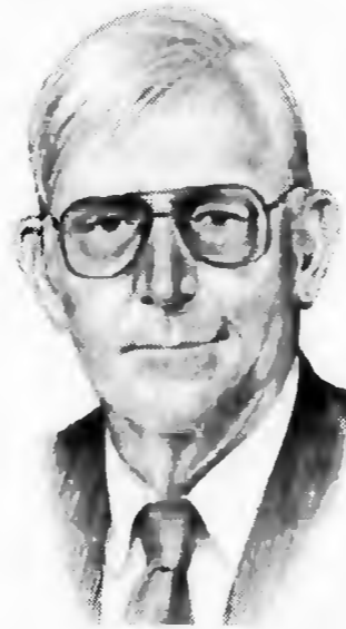
A sketch of Hendrix