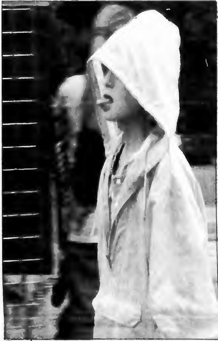
Clockwise from top: Kids eat as they watch entertainment at the library stage; a child gets a taste of the weather; the turkey on parade.