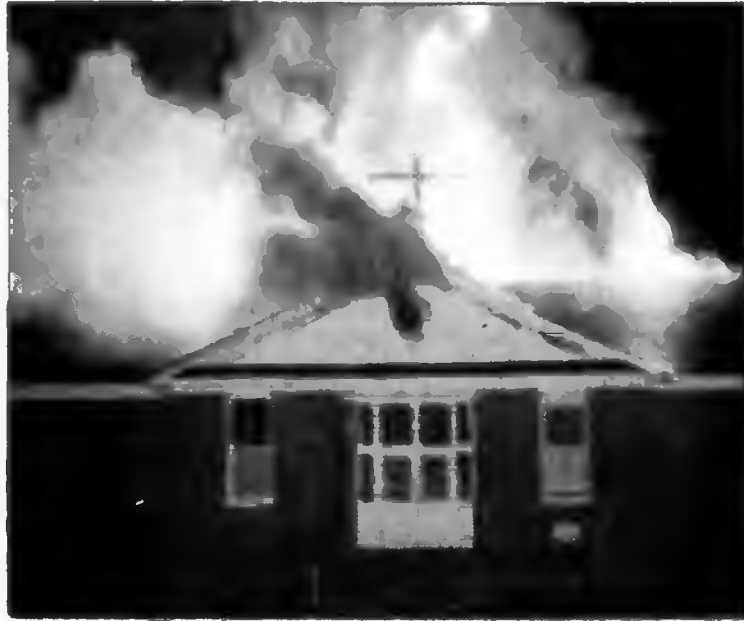
Rich in history, the former Mildouson School was destroyed by fire early Monday morning.