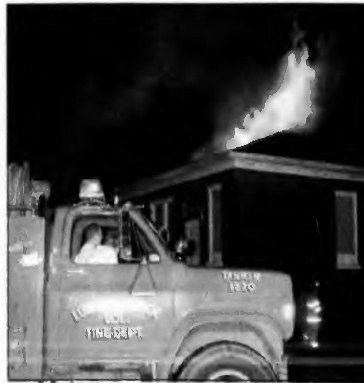
Lumber Bridge firemen arrive to fight the fire at the old school.