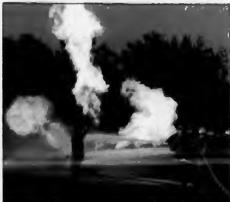
Instructor Brian Mims is outlined by flames 100 feet high.