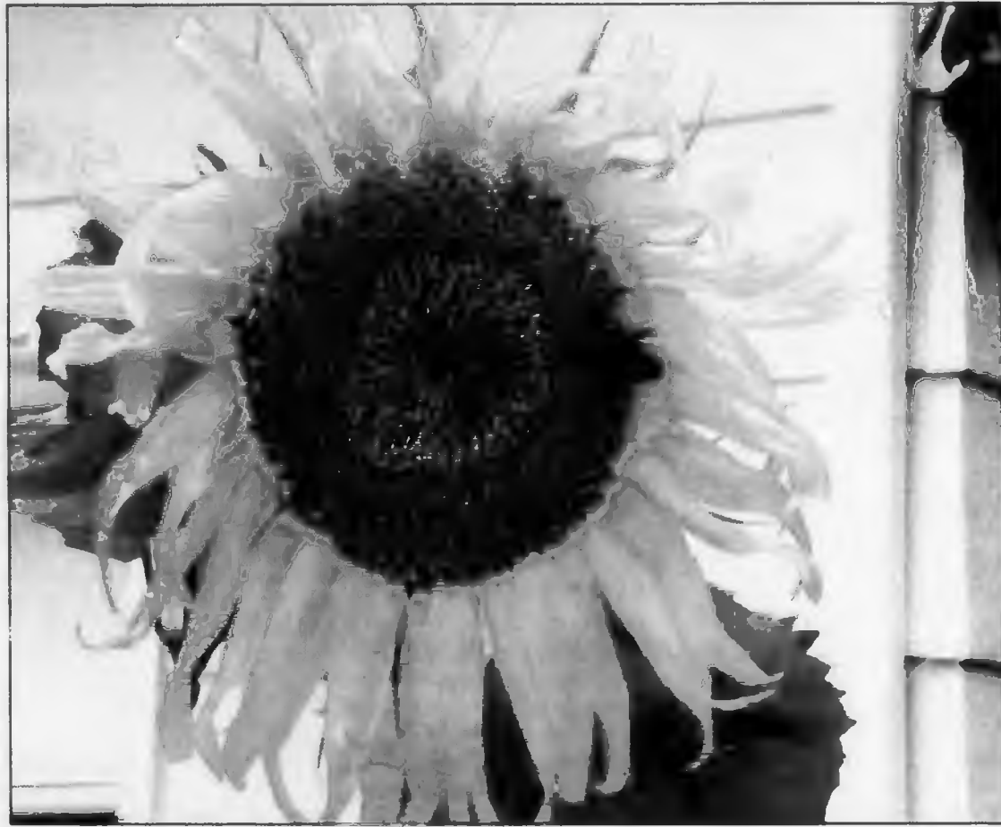
A summer visitor (barely visible on the blossom) basks in the warm welcome of a sunflower.