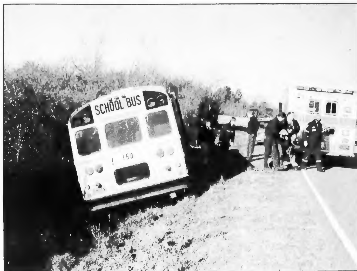
The last student is taken off a school bus after Monday morning's mishap.