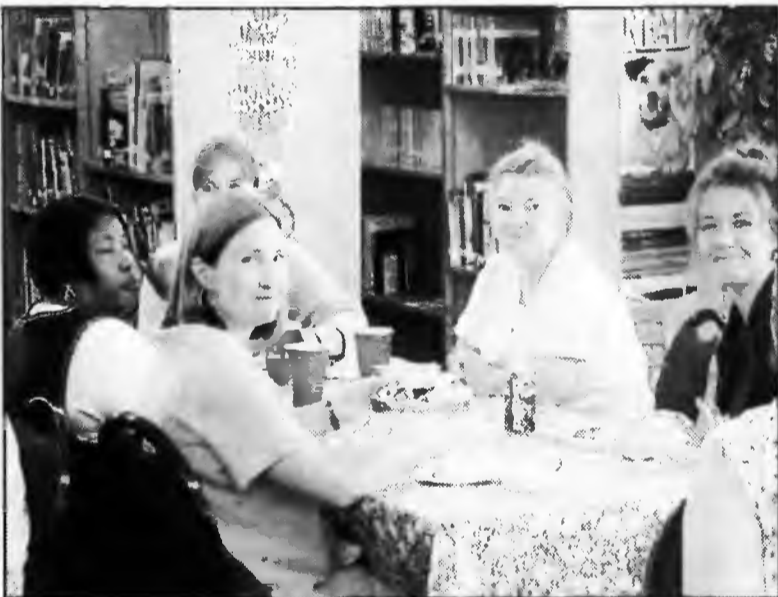
A big 'thank you' Pictured above and below, the staff of Upchurch Elementary felt "very appreciated" by parents of their charges after a steak luncheon was provided by the Parent Teacher Organization (PTO). The steak, salad and desert meal was served during Teacher Appreciation Week as a "small but tasty" way of thanking the teachers for "going above and beyond the call of duty in everyday situations."