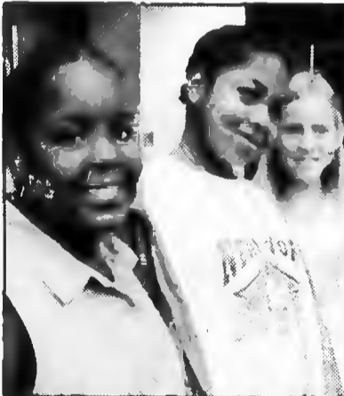
End of grading motivation Sandy Grove Elementary third, fourth, and fifth graders relieved stress following the first day of state testing with face painting and a pep rally.