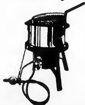
Sportsman's Choice $79.95