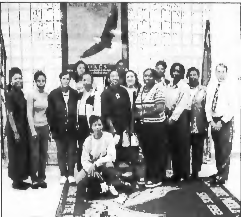
Volunteers at EHMS The End-of-Grade Testing at East Hoke Middle School went well, thanks to the help of the Parent and Community Volunteers. Students were tested during the week of May 20 - 22.