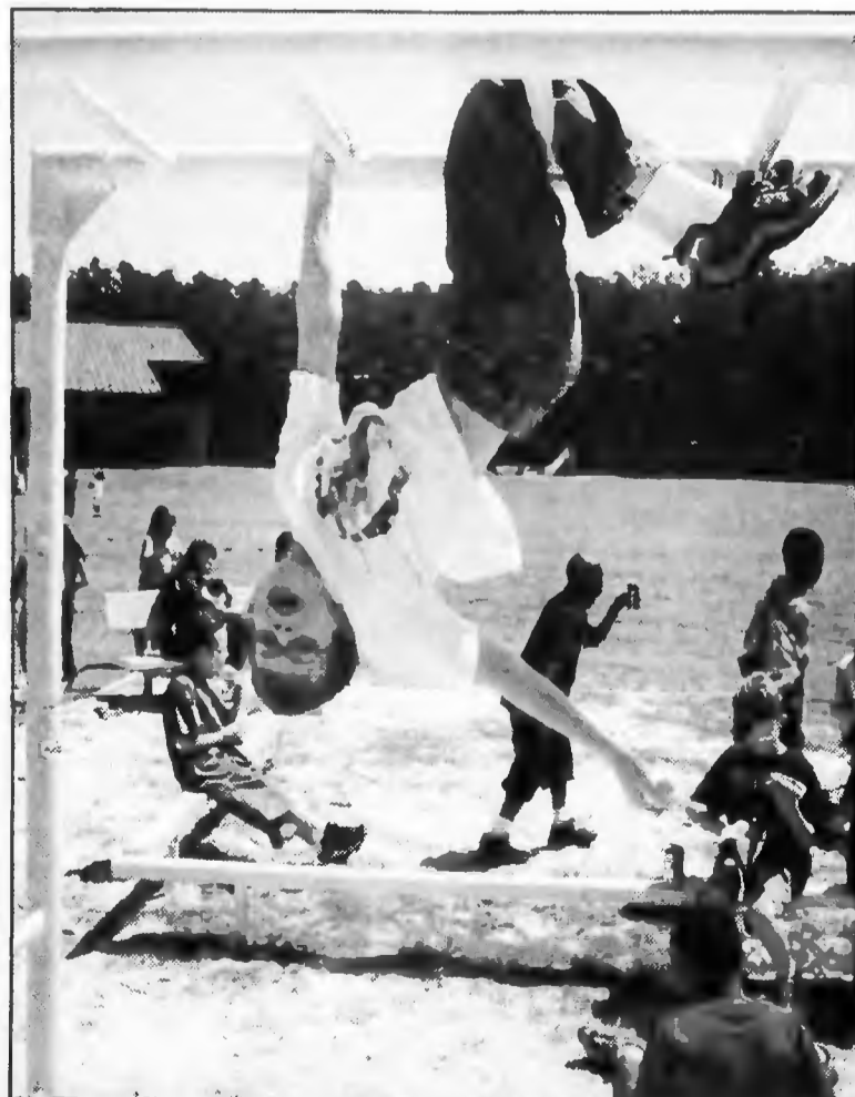
Hanging upside down for reading. Students enjoyed fun outside on the new playground and a cook-out at Sandy Grove Elementary PTO on May 13 and 14 to celebrate their successes in reading and becoming members of the Dove reading club.