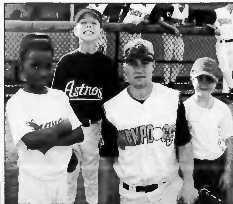
Braves players basked in the attention of their baseball heroes.