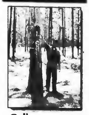
Calloway tract houses woodpeckers page 4A