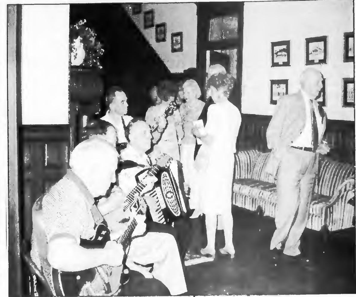
Musicians played tunes from the past century as visitors strolled through the McLauchlin-McFadyen home.