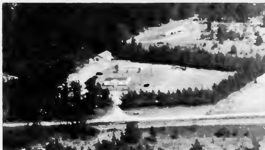
Shown in an aerial view is the Ashley Heights Trucking firm's compound located between Raeford and Aberdeen.