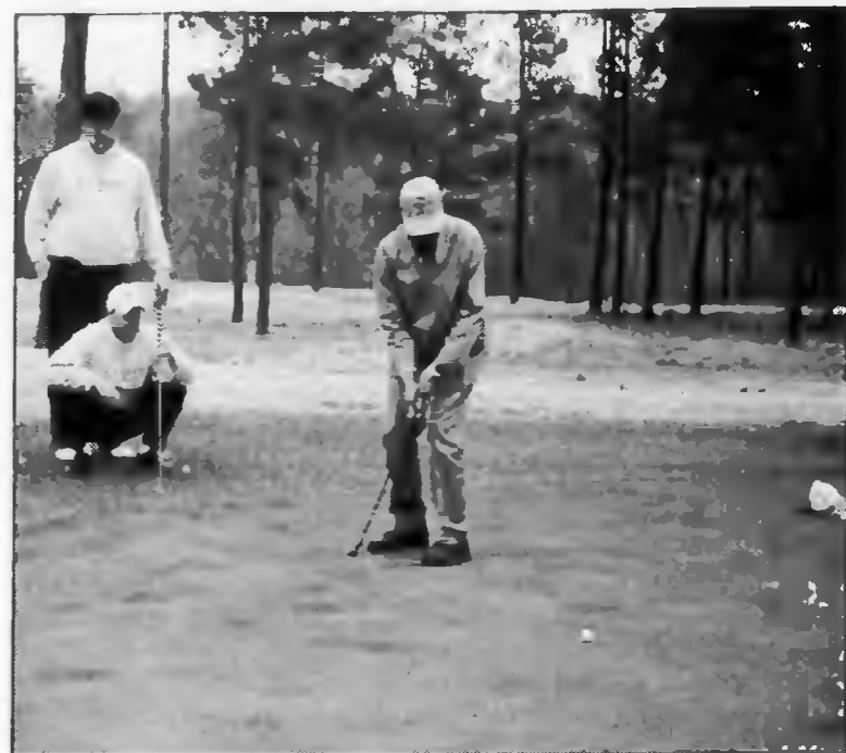
A player putts under the watchful eye of other players.