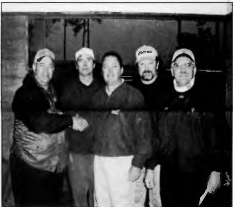
Winning team from the Mitch Tyler Scholarship Golf Tournament.