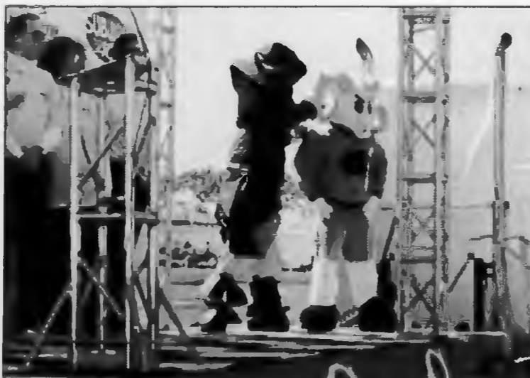
The Pirates hope to knock out the Tarheels next October when they meet in Greenville.

Aug. 30, Florida State at North Carolina Sept. 13, N.C. State at Ohio State Sept. 20, East Carolina at Wake Forest Sept. 27, North Carolina at N.C.