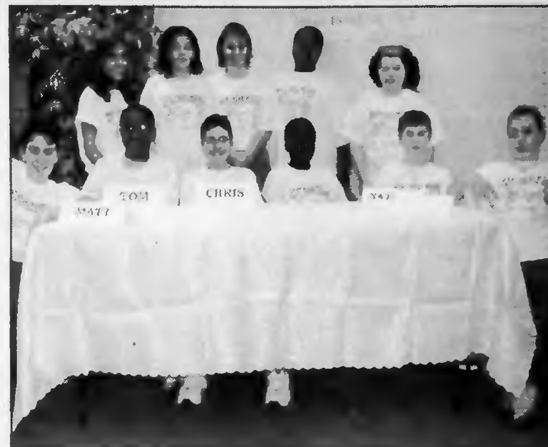
Top photo — the victorious East Hoke Middle Battle of the Books team. Bottom — the West Hoke Middle team.

The East Hoke Middle School Battle of the Books team defeated West Hoke Middle Tuesday night of last week during the County Battle held at West Hoke Middle School.