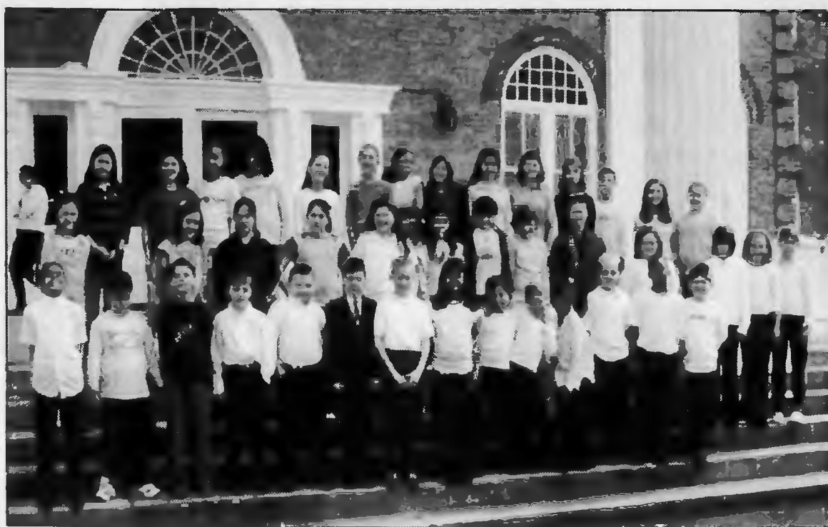
Flora Macdonald Academy's honor students.