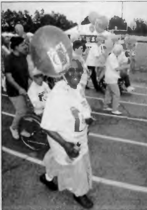
Relay for Life scenes