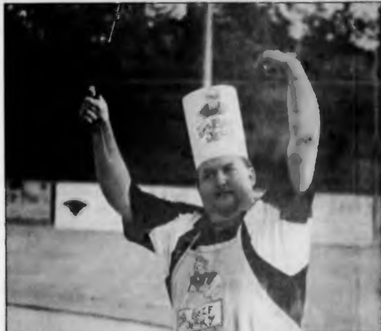
Uncle Zip's "Jerky Man" celebrates his win in the chipping contest at J.P. Riddle Stadium last Friday night

The Swampdogs play in the Coastal Plain League, which is a collegiate summer league that uses wooden bats. This league allows up and coming college baseball players the opportunity to gain more experience on the field and use wooden bats like the pros.