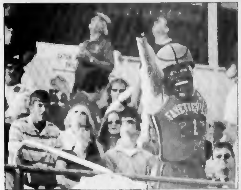
Sergeant Slam from the Fayetteville Patriots was on hand for the opening night of the Coastal Plain league game between The Fayetteville Swampdogs and the Wilson Tobs.