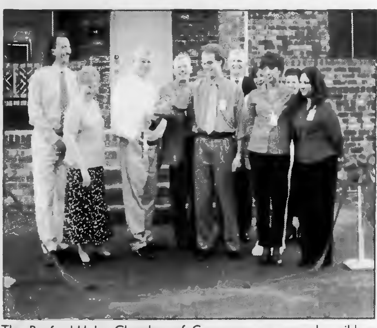
The Raeford-Hoke Chamber of Commerce sponsored a ribbon cutting at Raeford Pediatrics last week,