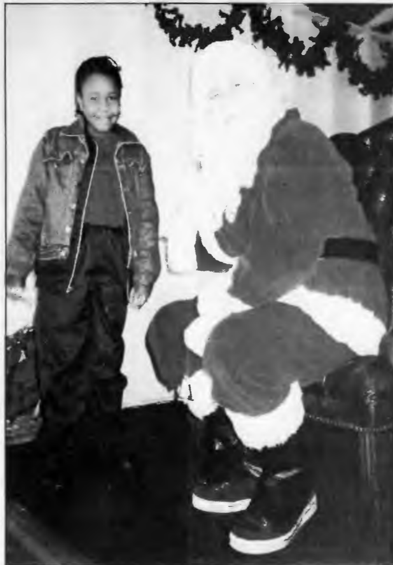
Santa Claus will visit children at Santa House, located at the Hoke Library, on Fridays and Saturdays at designated hours until Christmas.

SANTA CLAUS will be at the Santa House near the Hoke Library at 11 a.m.-1 p.m. Saturday, December 20. CLOTHROOM REUNION is planned for Saturday, December 20 at 6 p.m. at the Vocational Options of Hoke building, located on Turnpike Road — it's the light blue building on the right after turning off Highway 211 Aberdeen Road and coming from West Hoke Elementary School, it's on the left near the Aberdeen Road intersection. Cost is $25 per person and that includes a meal, dancing and a fashion/talent show. Make checks or money orders payable to Clothroom Reunion. The deadline is December 16. For more information, contact Odessa McLinnham at 843-5856; or Dorothy Hollingsworth at 875-6222.