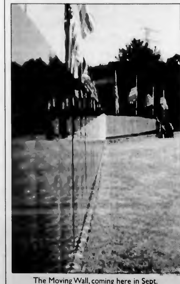
The Moving Wall, coming here in Sept.