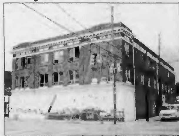
The old Raeford Hotel. Its days are numbered.

Bizzell checked references supplied by EME, he said, and two projects were completed in Asheboro, where his firm is headquartered. There, (See RAEFORD HOTEL , page 6A)