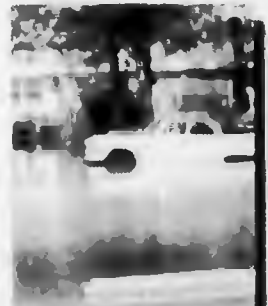
Roads, homes flooded by storm page 9A