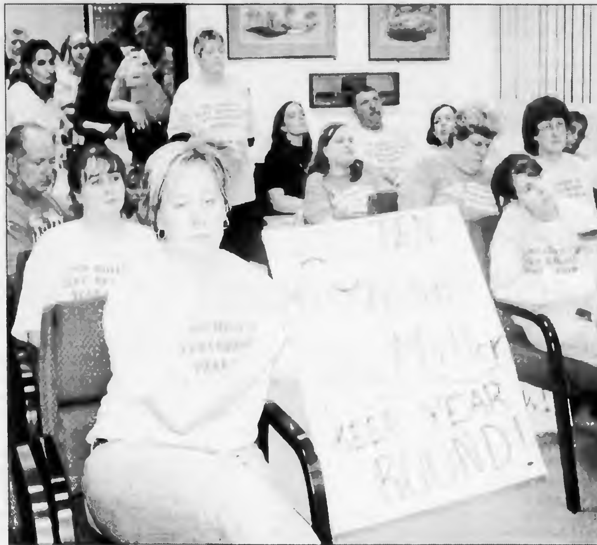
Hoke educators converged as a group at the Hoke Board of Education meeting last night to oppose reverting to a traditional school calendar at all schools.