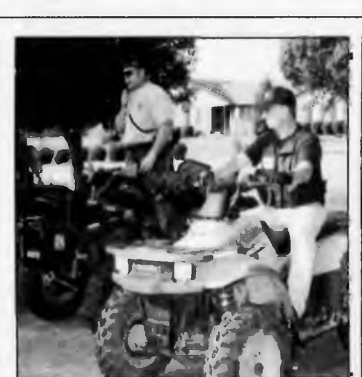
Above: Cumberland and Hoke deputies radio nearby officers as they search on King Road. Right: An agent from the N.C. Bureau of Alcohol Tobacco and Firearms readies his weapon at Stoney Point Fire Department.