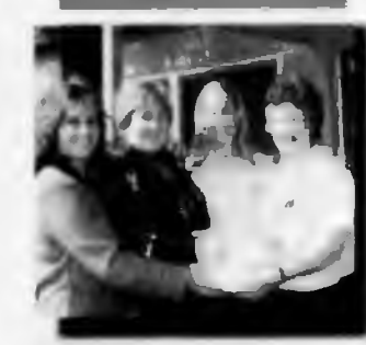
Unilever workers give up vaccines page 4A