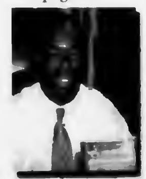
'Bring them home alive, sheriff sings page 3A