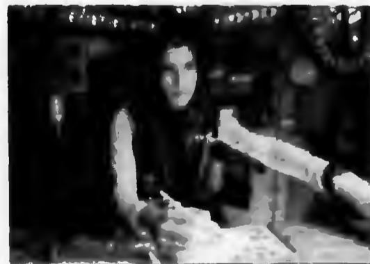
Left: the Pate brothers, Jonas (L) and Josh; above, Lake Bell as Dr. Laura Daughtery.