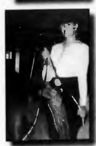
Local teen rides champion horse page 5A

Write-in sheriff's candidate profiled page 3A