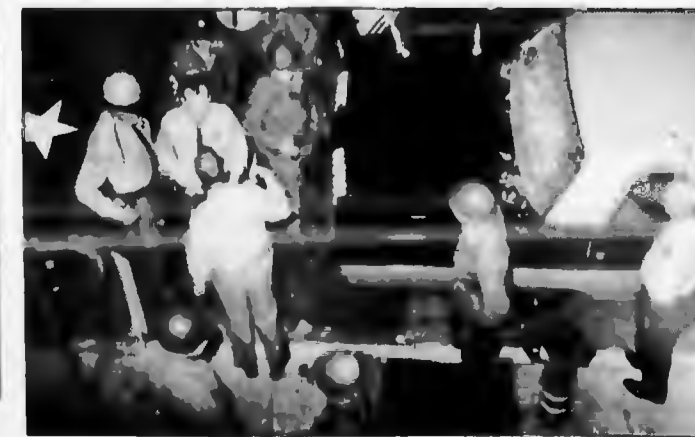
Minshew's rear window was shot out the night King died.