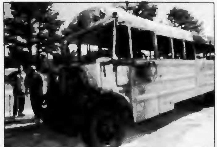
Bus garage workers survey the damage from Monday's fire.

Early on Monday, black smoke began filling the moving bus loaded with East Hoke Middle School students, who were evacuated by school (See BUS FIRE , page 4A)