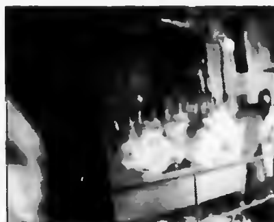
Video: alleged worker punched bird.