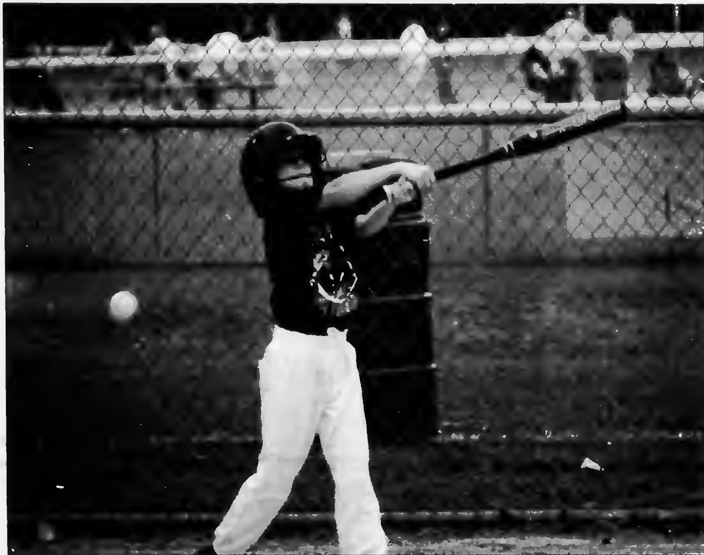
This little guy from the Hoke County Parks and Recreation Tigers Coach Pitch team gave every ounce of energy he had trying to hit that ball. The recreation leagues are winding down and the regular season will be complete after the first week of June.