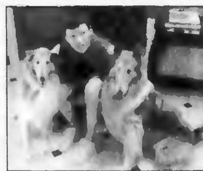
"Collie" (left) with new guardian.