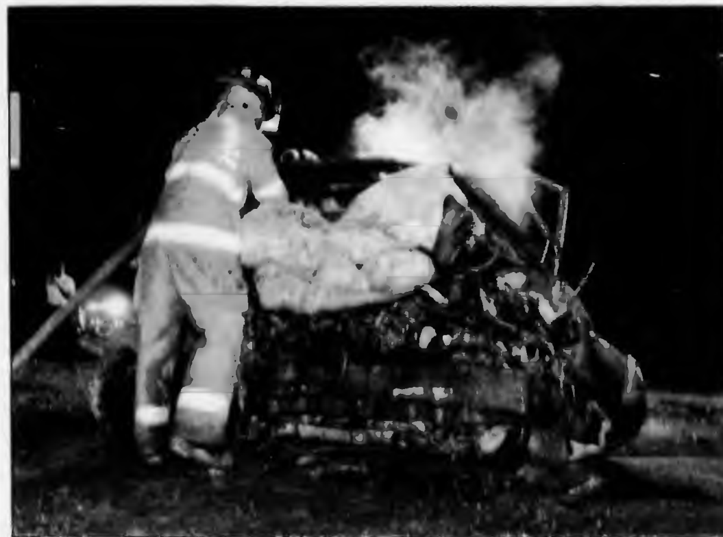
A Lumber Bridge fireman hoses down a Mazda that crashed Sunday.

"The Mazda crossed the centerline and struck the (See WRECK , page 4A)