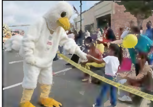
Clockwise from top: The Hoke High Band performs at the Festival review stand; the Turkey meets his (her?) public; seniors ride Senior Services float.