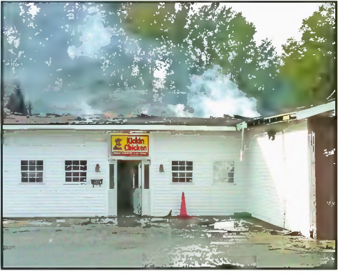
The Kickin Chicken burned early Saturday.