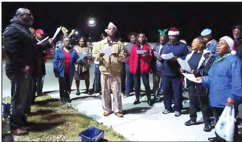
Carolers with the Lewis Chapel Missionary Baptist Church—West performed Christmas songs Friday in the parking lot of a gas station next to Walmart.