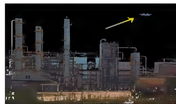
Strange light captured over former ethanol plant.

There's been no public announcement, but The News-Journal has learned a company known as Area 51 Inc. has purchased the former ethanol plant in Dundarrach. Though no officials will confirm the report, we've learned the company has converted the plant to manufacture a "special blend" (See ETHANOL , page 4A)