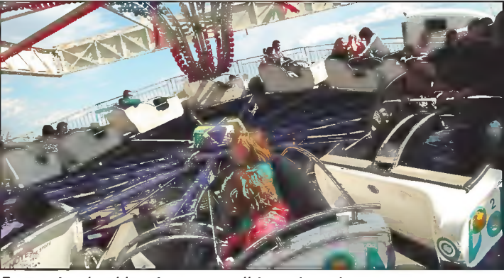
Festival rides like this one will be a key draw.

The festival will help raise money for the East Hoke Middle School Student Initiative Program and the Hoke County Schools (See POKEE , page 6A)