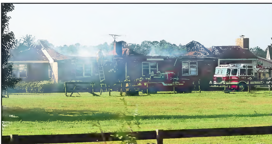
This house caught fire Monday and then again Tuesday.