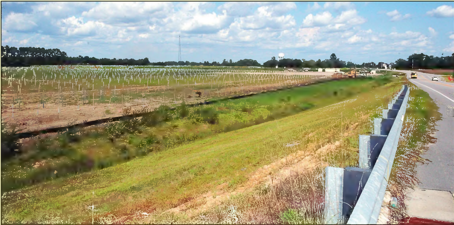
Support poles go up at a solar farm located at St. Pauls Rd. and East Palmer Street. The poles will soon hold solar panels.

Part of the reason for the shortage is while (See TROOPERS, page 4A)