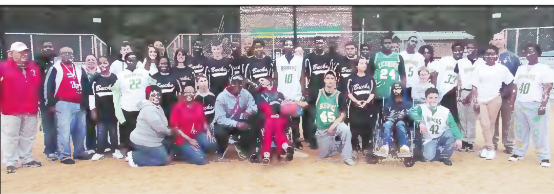
Now Exceptional Students can enjoy sports year-round.