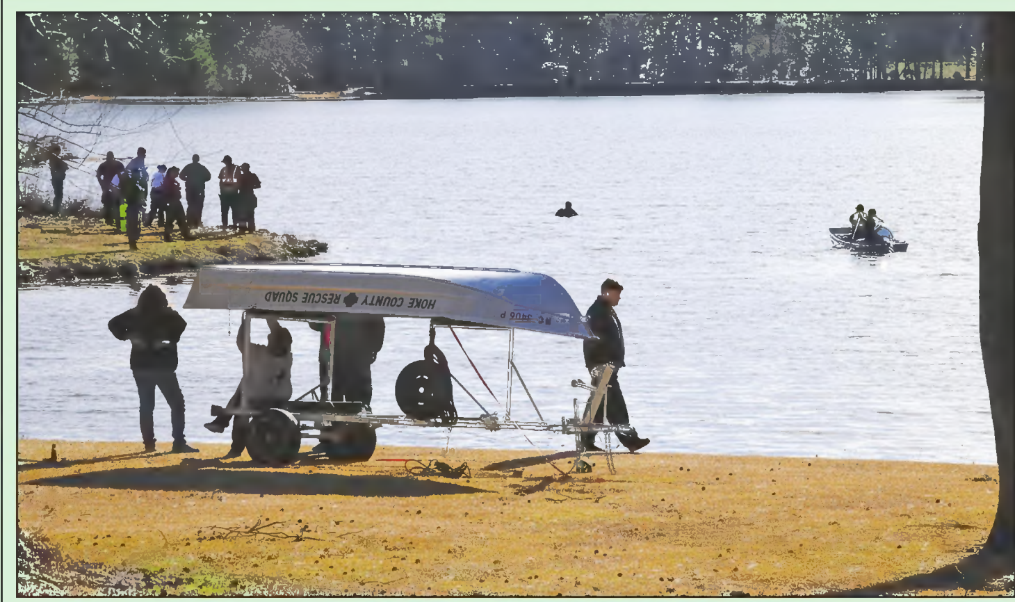
Authorities search for a missing man who fell into Williamson Pond last Wednesday while fishing.

Other proposed projects (See SCHOOLS, page 6A)