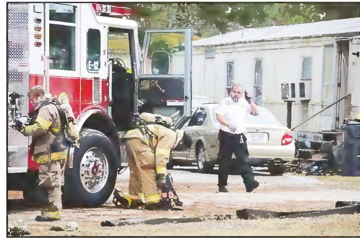
The scene where a child suffered third degree burns.