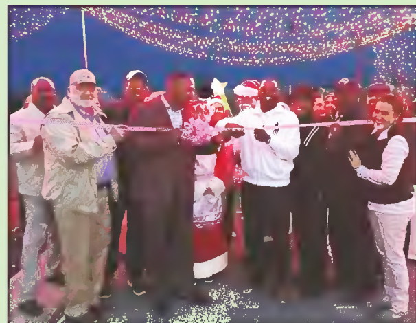
Above, county officials cut the ribbon for the Christmas celebration at the park. At left, Santa and Mrs. Claus await visitors.