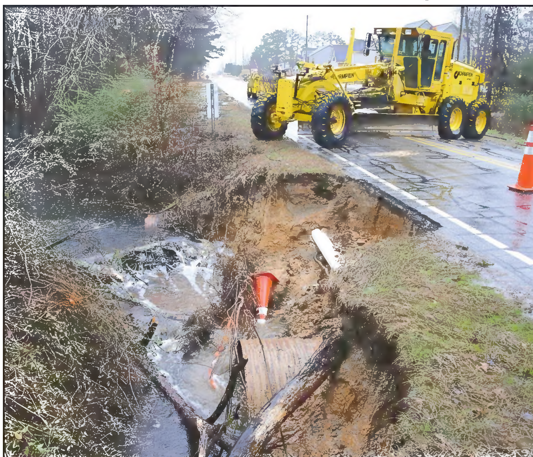
DOT crews blocked Lindsay Road after it was washed out by flooding water Friday. The road remains closed between Stoney Point and Adcox roads.

Part two of the announcement was that there ain't (See OTHER STUFF, page 4A)