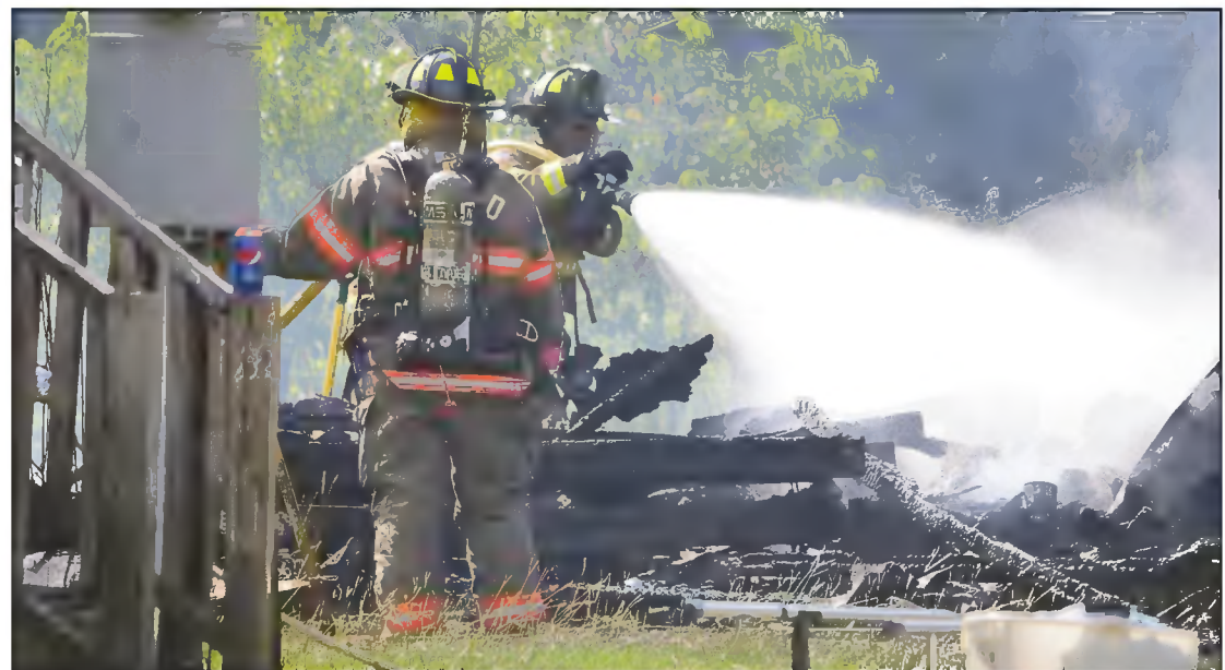
A barn in the backyard of a home on the 300 block of Brewer Drive, just off of Cope Road, burned to the ground Monday afternoon, as the heat index topped 110. The building was fully engulfed in flames when firefighters arrived. No one was injured, according to responders at the scene.

State legislators are considering a plan that over the next two years would add about 2,000 teacher positions to public schools, but cut about 5,000 teacher assistant positions. Supporters of the plan believe that the change would help reduce class sizes by putting more teachers in schools, with the ultimate goal of having one teacher (See ASSISTANTS , page 10)