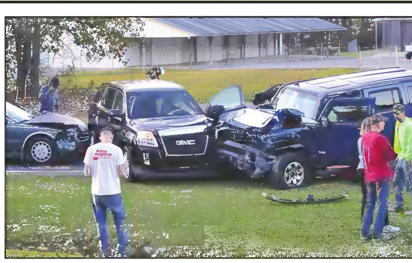
This 4-car accident Monday occurred when a driver ran a red light.

A driver allegedly ran a red light at the intersection of Highway 401 Business and North Fulton Street around 4:30 p.m. Monday and caused a chain reaction accident that damaged four vehicles and sent three people to the (See WRECK, page 4)