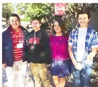
4 youth attend conference Page 2

Children give blankets for children Page 6