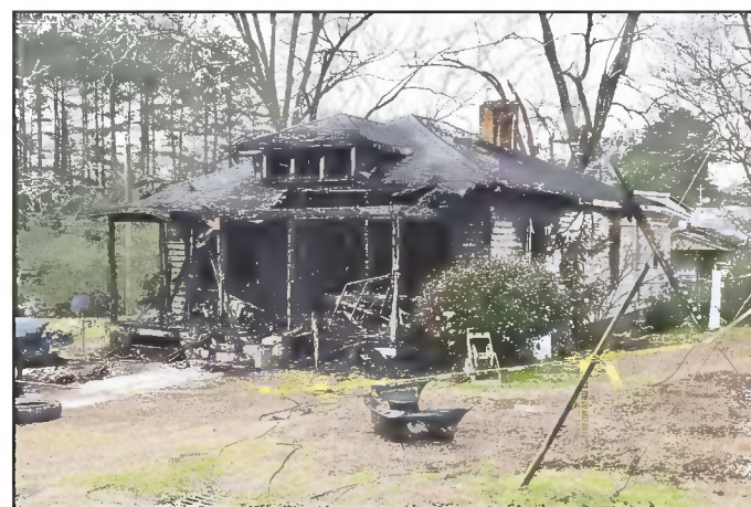
This South Stewart St. house is a total loss.