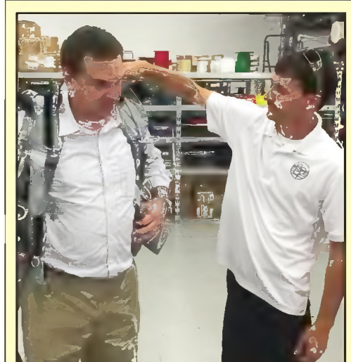
Congressman visits Congressman Richard Hudson (left) visited Raeford Tuesday, stopping by Sun Path and downtown stores.

People who graduate from the academy (See ACADEMY, page 6)